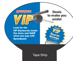
2 Inside Reader Bursts